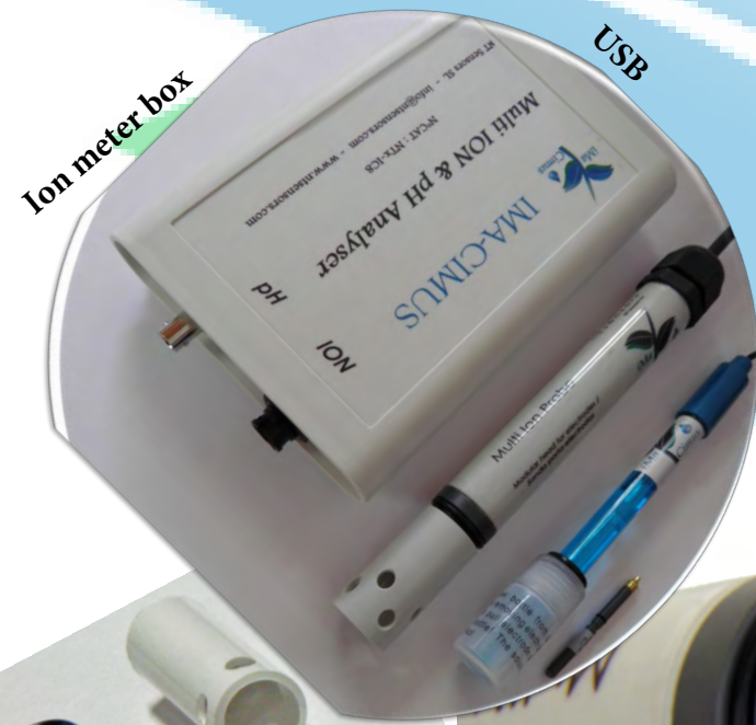
Ion meter box