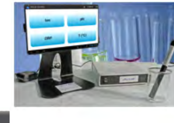
Connexion sur Tablette en poste fixe