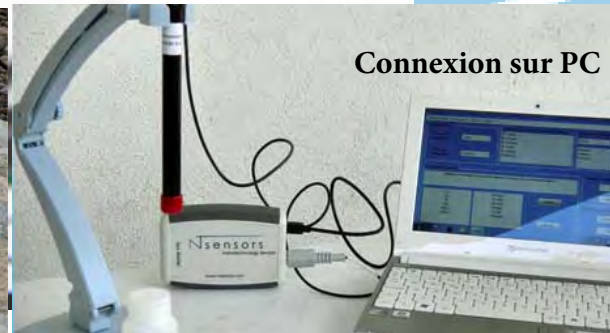
Connexion sur PC