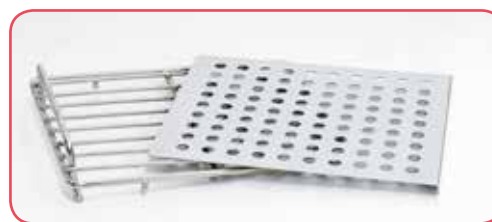
Holed platform applicable to wire shelves for TCN and TCF models

The door seal ensures a perfect sealing even at higher temperatures. The heat losses are thus reduced to a minimum enabling efficient heating cycle.