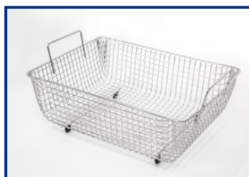
Mesh basket for all models