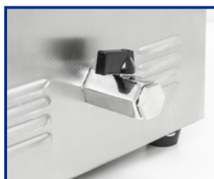
Emptying valve for DU-100 and AU-450