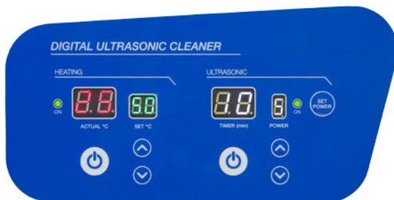
Front panel of DU series

All models are provided with a stainless steel mesh basket, stainless steel lid and 1x 60 ml concentrate universal cleaner solution