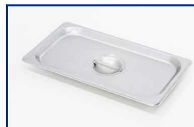
Stainless steel lid for all models