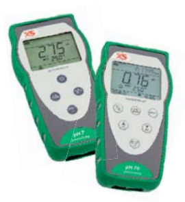
pH Series pH 7 - pH 70