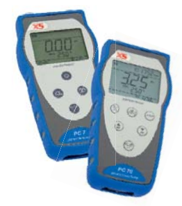
Multiparameter Series PC 7 - PC 70