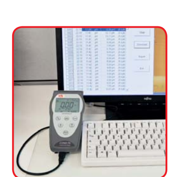
Computer connection with USB