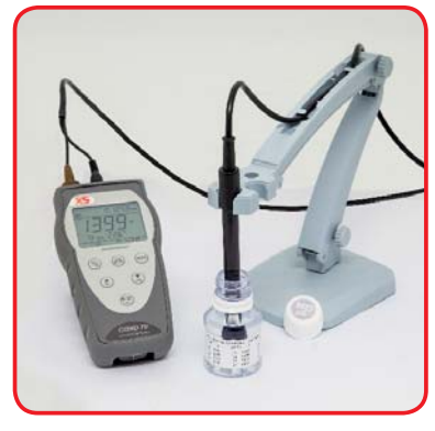
Electrode hoder for use on laboratory bench (optional)