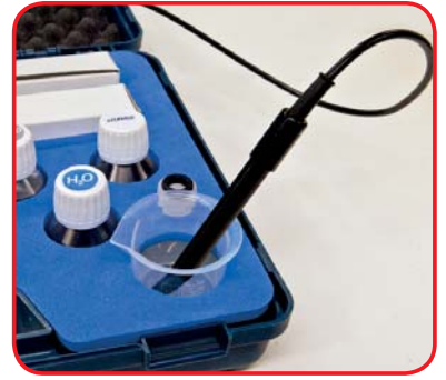
Measuring sample placed in a way that prevents accidental spills